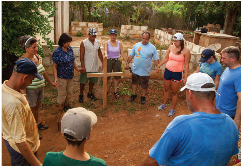
Friends of the Episcopal Church of Cuba

Gifts are tax deductible, as provided by law. Please consult with your financial advisor to determine the maximum tax benefits for you.