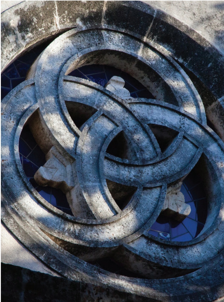
Friends of the Episcopal Church of Cuba