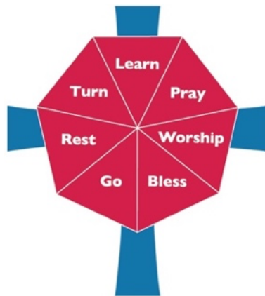
THE WAY OF LOVE Practices for Jesus-Centered Life

In Genesis 1-2, God calls the creation “good” and rests. What can you proclaim to be “good” instead of “not enough” as a witness to God’s love for the world today?