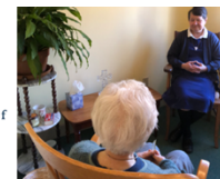
© 2021 The Domestic and Foreign Missionary Society of the Protestant Episcopal Church in the United States of America. All rights reserved.