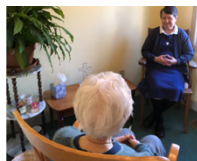
© 2021 The Domestic and Foreign Missionary Society of the Protestant Episcopal Church in the United States of America. All rights reserved.