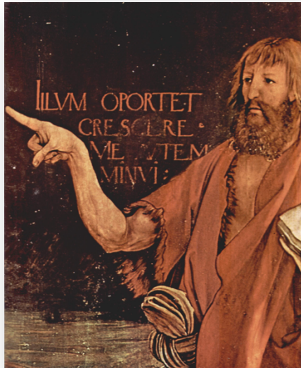
John the Baptist from Matthias Grünewald's Isenheim Altarpiece. The text, referring to Jesus, reads, "He must become greater, I must become less."

Almighty God, by whose providence your servant John the Baptist was wonderfully born, and sent to prepare the way of your Son our Savior by preaching repentance: Make us so to follow his teaching and holy life, that we may truly repent according to his preaching; and, following his example, constantly speak the truth, boldly rebuke vice, and patiently suffer for the truth's sake; through Jesus Christ your Son our Lord, who lives and reigns with you and the Holy Spirit, one God, for ever and ever. Amen (Book of Common Prayer, p. 241).