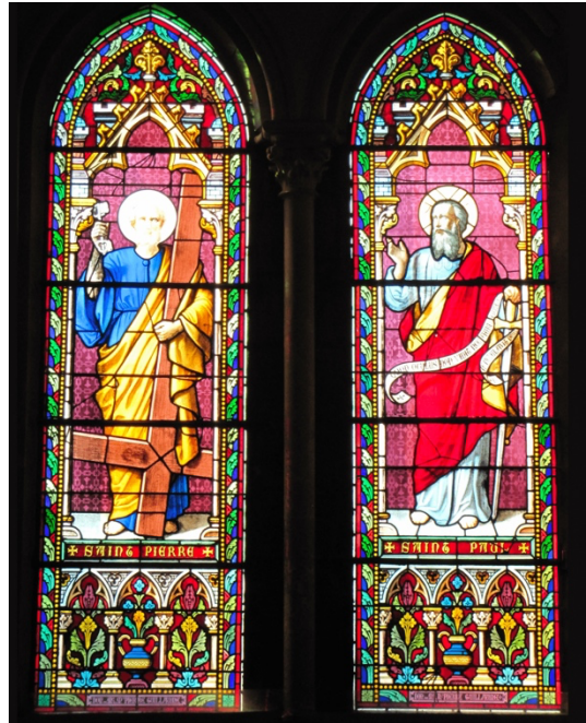
Stained glass, Sts. Peter and Paul and the instruments of their martyrdoms. Church of St. Thomas, Jersey

Almighty God, whose blessed apostles Peter and Paul glorified you by their martyrdom: Grant that your Church, instructed by their teaching and example, and knit together in unity by your Spirit, may ever stand firm upon the one foundation, which is Jesus Christ our Lord; who lives and reigns with you, in the unity of the Holy Spirit, one God, for ever and ever.