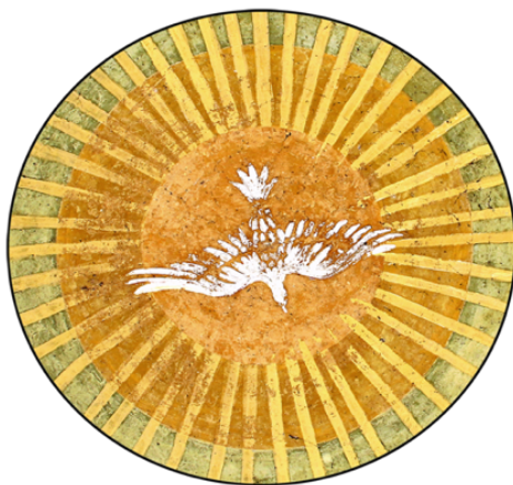
Detail from 13th-century fresco above baptismal font, Zica monastery, near Kraljevo, Serbia.

“Then Jesus came from Galilee to John at the Jordan, to be baptized by him. John would have prevented him, saying, ‘I need to be baptized by you, and do you come to me?’ But Jesus answered him, ‘Let it be so now; for it is proper for us in this way to fulfill all righteousness.’ Then he consented. And when Jesus had been baptized, just as he came up from the water, suddenly the heavens were opened to him and he saw the Spirit of God descending like a dove and alighting on him. And a voice from heaven said, “This is my Son, the Beloved, with whom I am well pleased”” (Matthew 3:13-17).